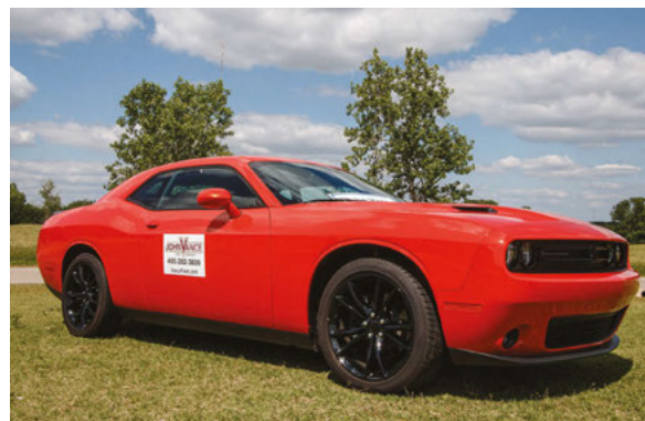
Above: At the YF&R golf event, John Vance Auto Group donated a Dodge Challenger to be awarded if any player hit a hole-in-one. Left: Attendees of the Oklahoma Farm Bureau Young Farmers & Ranchers Golf Tournament had fun participating in friendly competition at the SilverHorn Golf Club in Oklahoma City.