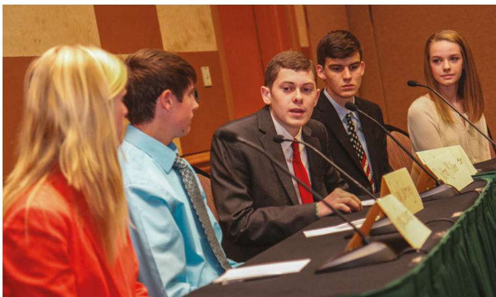
High school students discuss current agricultural issues during the 2016 Oklahoma Farm Bureau Young Farmers and Ranchers High School Discussion Meet.

Advisors must submit the High School Discussion Meet information sheet by June 15, 2017. A competitor's guide is also available on the Applications Center page